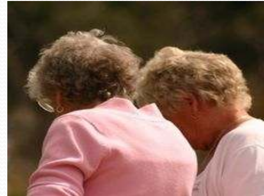
Retrieved July 26, 2011

Helping Hands adult daycare center is committed to providing effective structured activities and quality services to the geriatric population while promoting independence. Our experienced licensed staff focuses on caring for the whole client's mind, body and soul including support services for the primary caregiver.